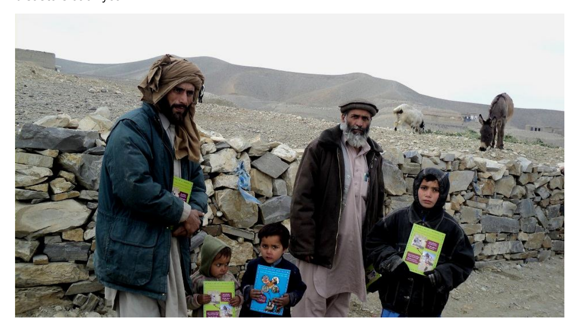
The Australian Government is supporting mine risk education (MRE) activities in Afghanistan. In this photo, Moosakhail village residents carry their MRE materials home

According to the United Nations, an estimated 7.4 million people will need urgent humanitarian assistance in Afghanistan in 2015. This includes 2.2 million very severely food insecure people and almost one million people who are displaced or of concern to the UN High Commissioner for Refugees. Some 900,000 people are also likely to be affected by mines and explosive remnants of war. On average, a quarter of a million people are also affected by natural disasters each year.