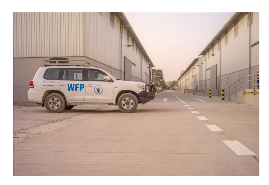
Kabul's Strategic Grain Reserve funded by Australia.

The United Nations and World Food Programme also work to strengthen the Afghan government, non-government and private organisations they work with in order to increase local capacity to respond to humanitarian crises in the future. Australia is contributing to enhanced food security in Afghanistan by supporting the World Food Programme's first Strategic Grain Reserve facility in Kabul. This 22,500